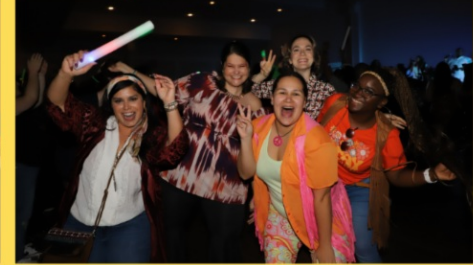
Annual Sugar Shindig - Our sweetest event of the year!